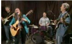
Live Lunch Break