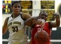
NFA vs. New London

Deaths from heroin in New London, Norwich doubled in 2013 COMMENTS (21)