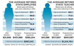
CT Pension Project