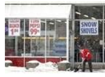
Mother Nature's latest round